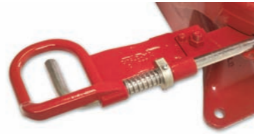
Interlock handle option