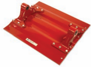
DIN mount and mounting plate

A wide range of mounting options is available, ensuring that Fontaine fifthwheels will fit any European chassis and suit any application.