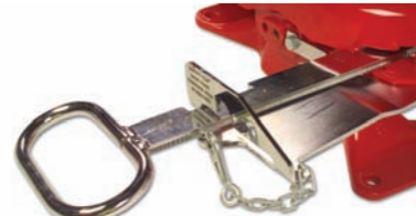
Extended handle option